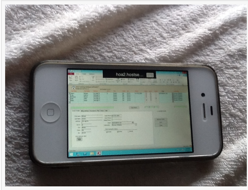
HOA / Condo Association Property Managment software running in the Cloud on iPhone 4s

The database itself can handle from a dozen to hundreds or thousands of